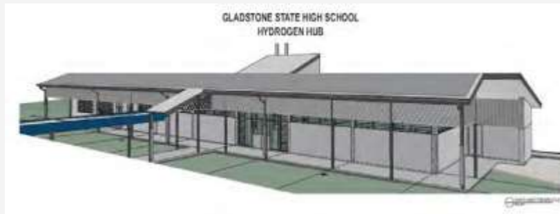
Hydrogen Hub Q-Block refurbishment and the new Hydrogen Hub are on track for completion for the commencement of Term 4 2023.