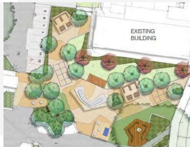
Green space The current site of the Design and Technology buildings will be turned into a green space for students to enjoy.